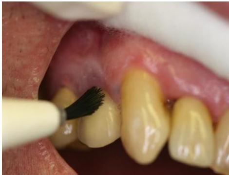
Figure 2 Topical application of Prevora

Prevora is a high-strength, sustained-release antiseptic which is topically applied by the hygienist to the teeth and gum line of the adult at high risk of root caries. Prevora works by re-adjusting the mix of bacteria in the dental plaque, shifting it from dysbiosis to symbiosis, so that dental diseases are minimized. The treatment plan involves 4 applications (Figure 2) in the first 8 weeks, followed by single applications every 6 months. Prevora has Class 1 evidence for caries, and is the only approved preventive treatment for root caries in Canada (DIN 02046245). It is administered under ODHA/CDHA procedure code 00606.